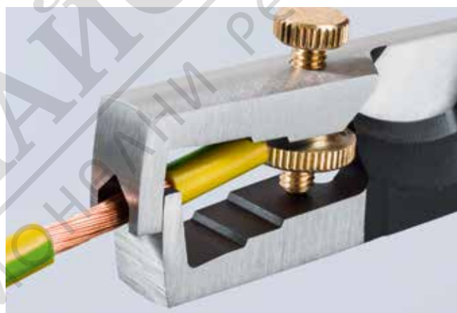
Lock nut prevents any unintentional adjustment