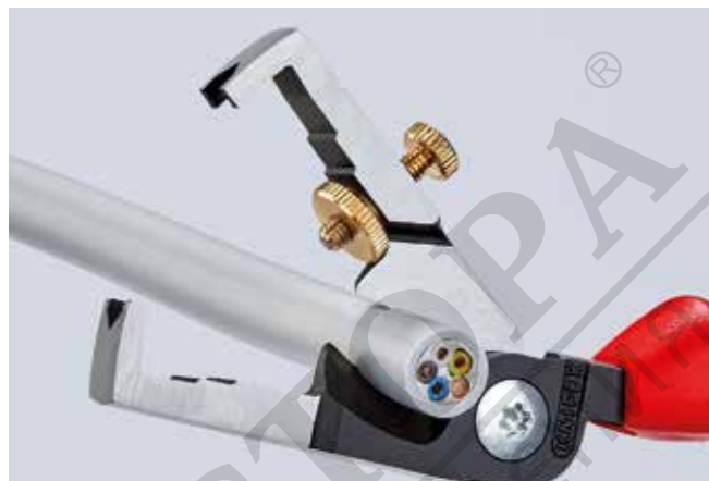
Induction hardened shear blade with precisely ground cutting edges for crushing-free cutting of copper cables up to Ø 15 mm (5 x 2.5 mm 2 )