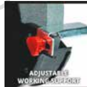
ADJUSTABLE WORKING SUPPORT