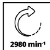
2980 min -1