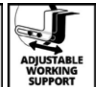
ADJUSTABLE WORKING SUPPORT