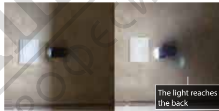
without Lamp shade