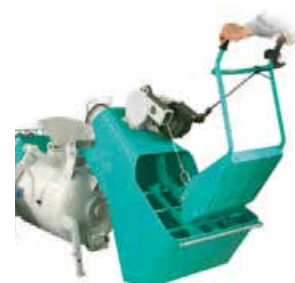
Cable and rope coilers with scraping shovel (optional)