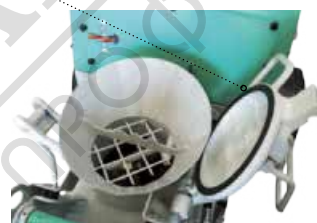
Hatch with built-in safety valve for easy and safe handling