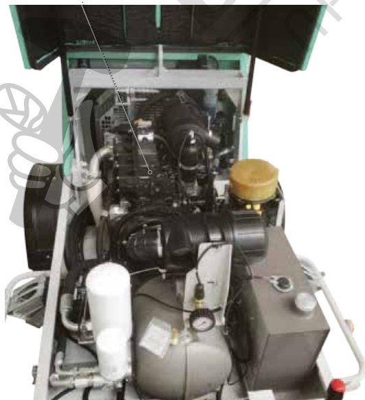
Yanmar Diesel engine 35 kW, 4-cylinder