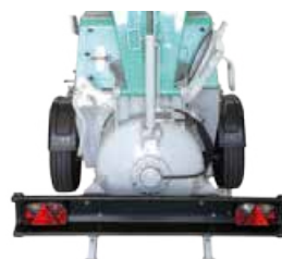
Drawbar with lights (road-towable version "R")