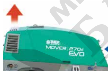
FAST-FLOW cooling system