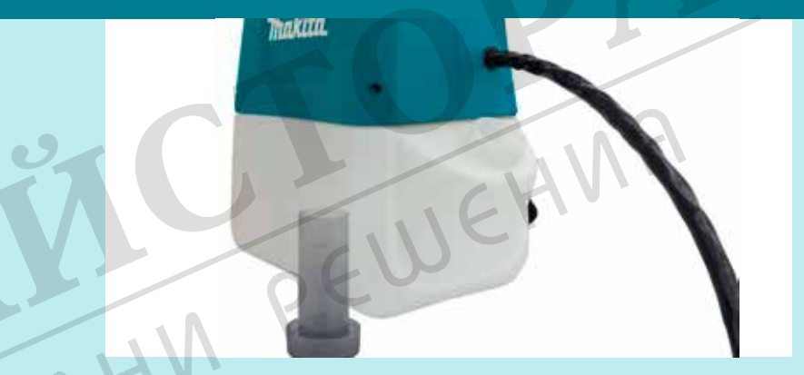
Easy fill tank with measuring cup inside cap