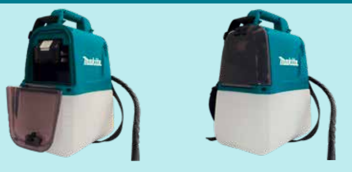
Covered battery compartment to minimize any water getting in