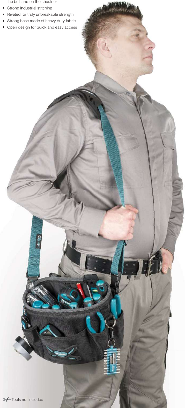
Tools not included