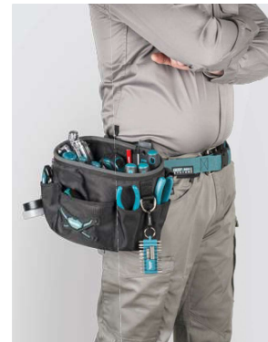
Oval shape keeps the tote stable on hips