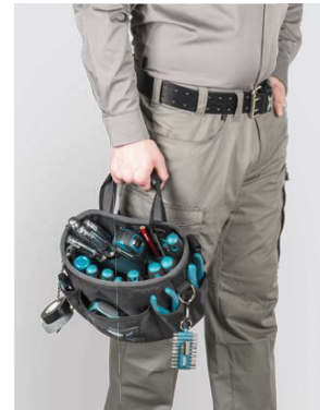
Ergonomic handle provides easy carrying