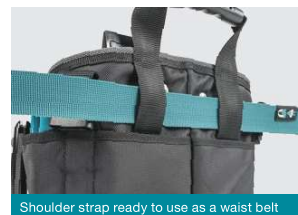
Shoulder strap ready to use as a waist belt