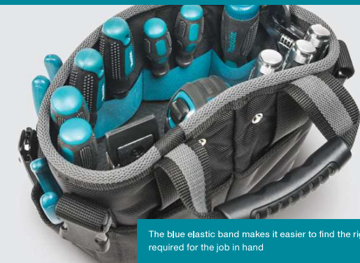
The blue elastic band makes it easier to find the right tool required for the job in hand