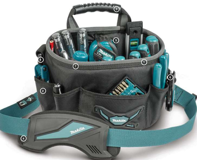
Tools not included