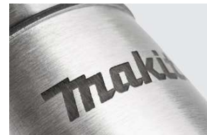
Laser engraved Makita logo