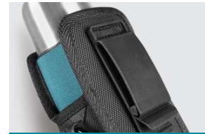
Loop-Clip Solution on the back

Universal design Elastic sides and easy access make this holder your "Must have"