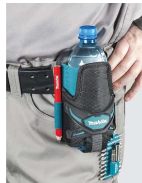
Holder can be used also for bottle of water