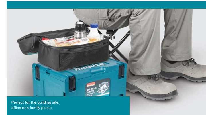
Perfect for the building site, office or a family picnic