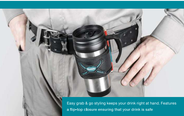
Easy grab & go styling keeps your drink right at hand. Features a flip-top closure ensuring that your drink is safe