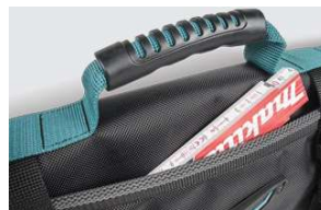
Handy front pocket for accessories