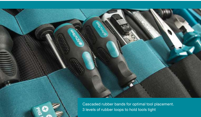
Cascaded rubber bands for optimal tool placement. 3 levels of rubber loops to hold tools tight