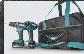
Perfect foundation for creating combo kits