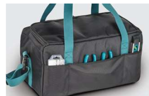
3 further external pockets on the back of the bag