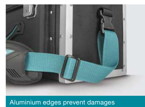
Aluminium edges prevent damages