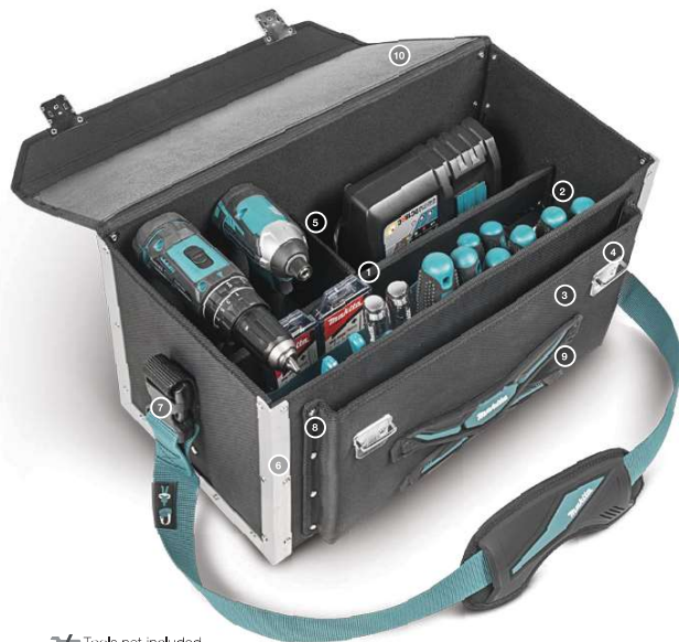
Tools not included