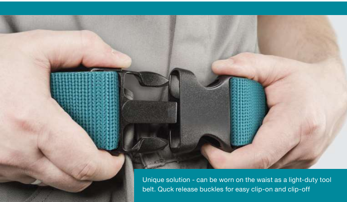
Unique solution - can be worn on the waist as a light-duty tool belt. Quick release buckles for easy clip-on and clip-off