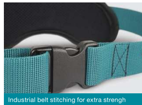
Industrial belt stitching for extra strength