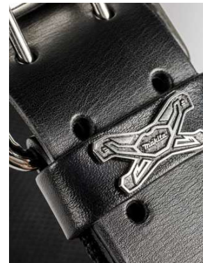
Makita metal logo on belt loop in spider design