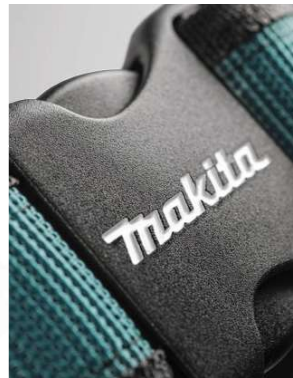
Engraved Makita logo on belt buckle