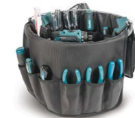
Back view of the Bucket Tote