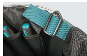
Adjustable straps to fit different sizes of buckets