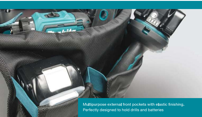
Multipurpose external front pockets with elastic finishing. Perfectly designed to hold drills and batteries