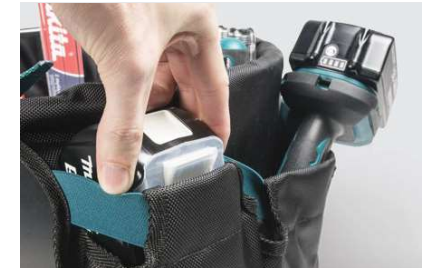
Flexible external pocket also for drills and batteries