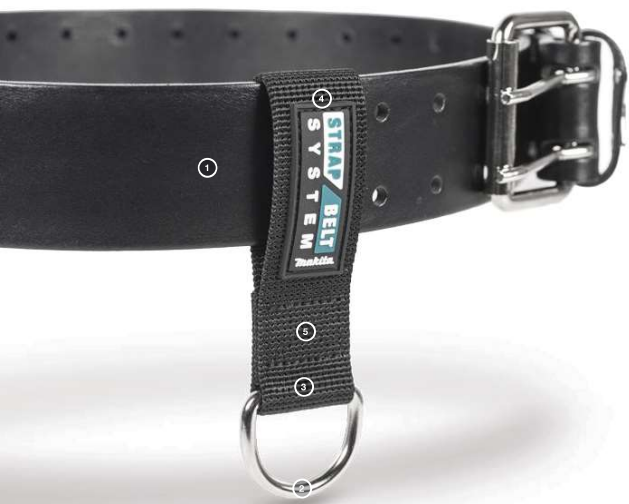
Belt not included