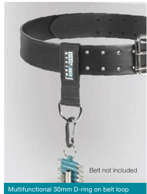
Belt not included