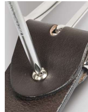
Screw for self size adjustment