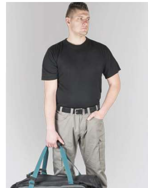
Both M and L version covers all waist sizes