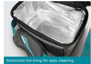
Aluminium foil lining for easy cleaning