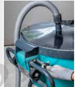
· Dust extraction ·