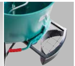
· Removable discharge chute ·