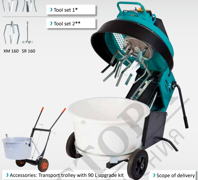
Accessories: Transport trolley with 90 L upgrade kit