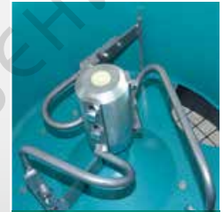
· Mixing tool ·