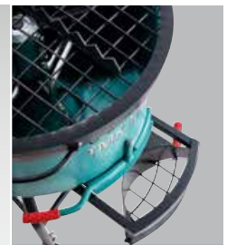
· Vibrating mechanics ·