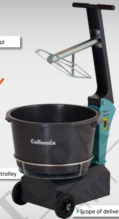
Scope of delivery