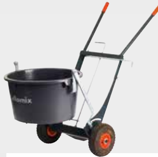
Additional accessory: Transport trolley