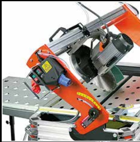
Position for 45° angle cuts.