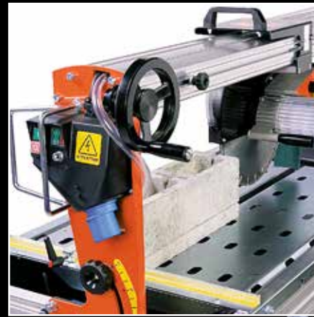
The CUTTING PROGRESS SYSTEM with HANDWHEEL adjusts the movement of the cutting head forward or behind.