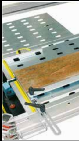
SIDE TILE SUPPORT Made to have the top straight and angled cuts angle-shot cut. Optional for the mode