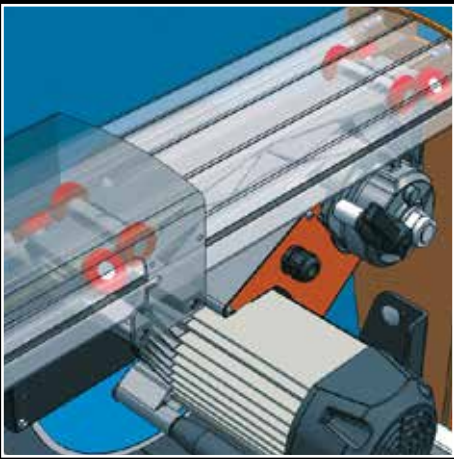
The carriage engine group slides with 8 ball-bearings on interchangeable stainless steel track.