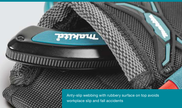
Anti-slip webbing with rubbery surface on top avoids workplace slip and fall accidents