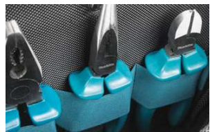
Extra elastic tool holders inside