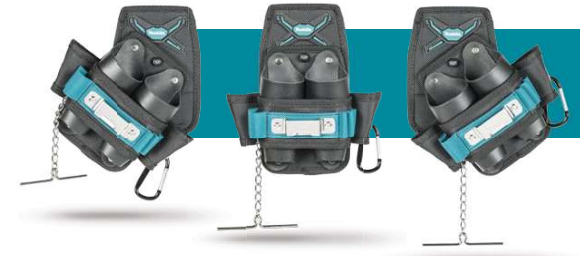
Swings to keep your tools always in vertical position