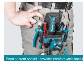
Worn on front pocket - provides comfort when kneeling