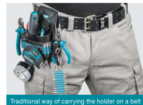
Traditional way of carrying the holder on a belt