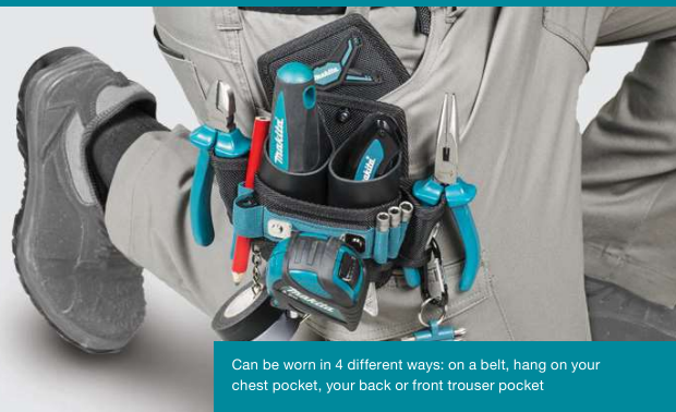
Can be worn in 4 different ways: on a belt, hang on your chest pocket, your back or front trouser pocket