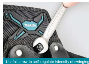
Useful screw to self-regulate intensity of swinging