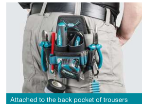
Attached to the back pocket of trousers