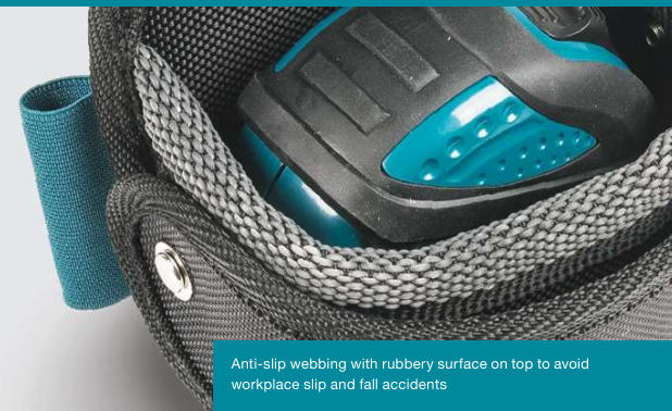
Anti-slip webbing with rubbery surface on top to avoid workplace slip and fall accidents