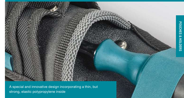
A special and innovative design incorporating a thin, but strong, elastic polypropylene inside