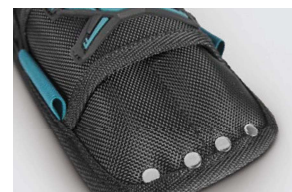
Riveted for durability and long life