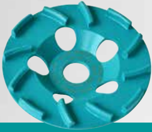
BST 125 Cyclon

for the concrete grinder CMG 1700 (∅ 125 mm)