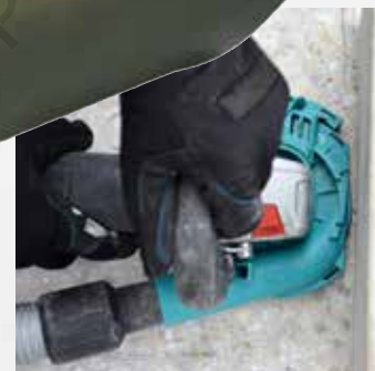
Practical segment opening for precise working on edges