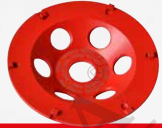
PST 125 Strap-it