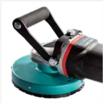
Comfortable grip for an optimum hold and safe grinding