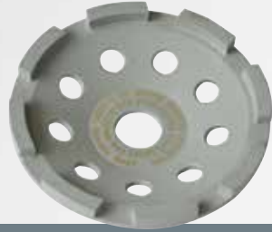
UST 125 Universal