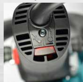
Visual performance monitoring as overload protection