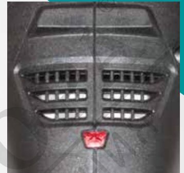
Visual performance monitoring as overload protection