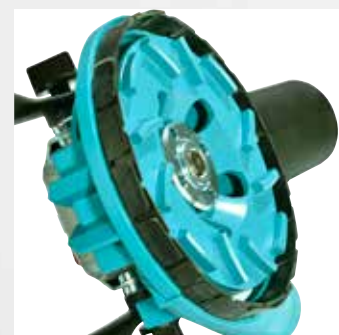
Closed lamellar ring for low- dust working*