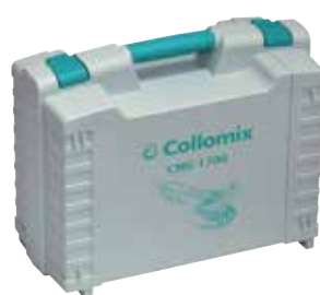
Robust case for safe and prac- tical stowage