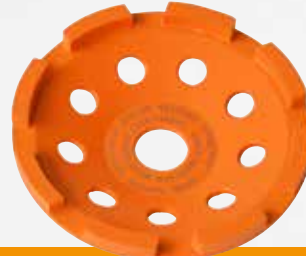
GST 125 Grinder