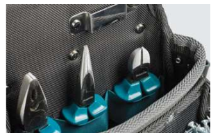
Extra elastic tool holders inside the pouch