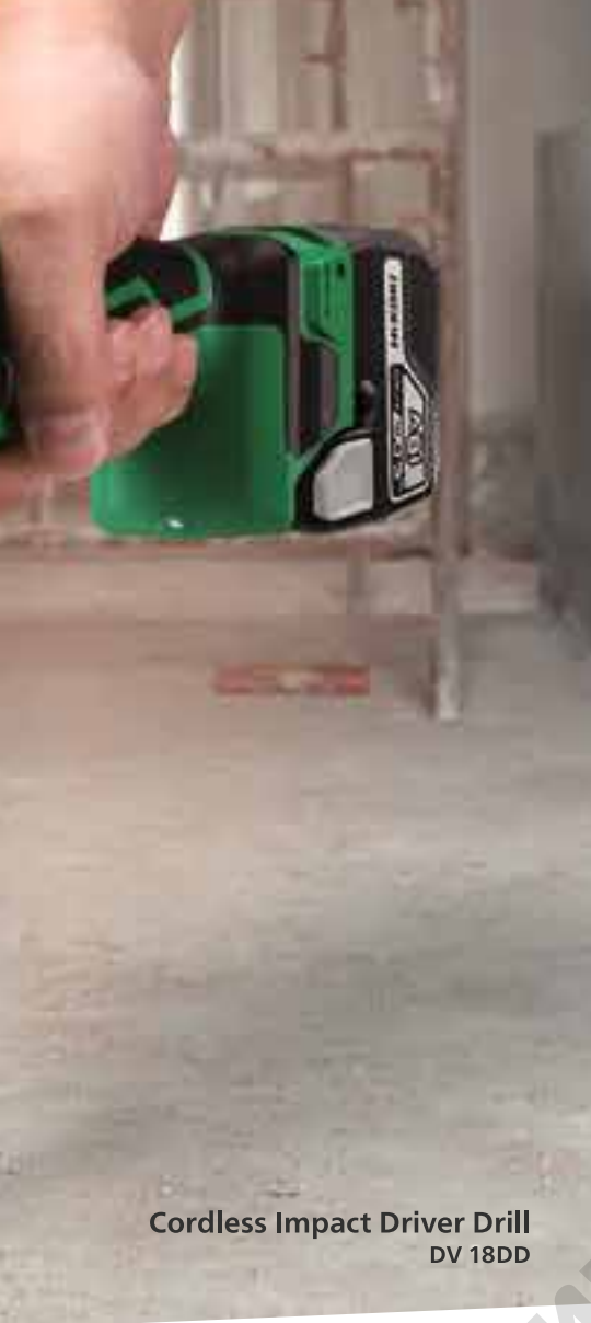
Cordless Impact Driver Drill DV 18DD