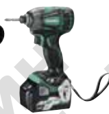
Cordless Impact Driver WH 36DB