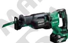
Cordless Reciprocating Saw CR 36DA