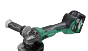
Cordless Disc Grinders G 3613DA G 3610DA G 3613DB G 3610DB G 3612DA