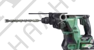
Cordless Rotary Hammers DH 36DPA DH 36DPC DH 36DPB DH 36DPD