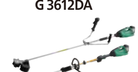
Cordless Grass Trimmers CG 36DA/(L) CG 36DTA/(L)