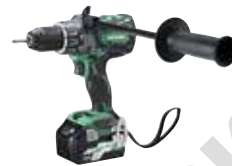
Cordless Impact Driver Drill DV 36DA