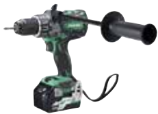
Cordless Driver Drill DS 36DA