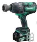
Cordless Impact Wrenches WR 36DA WR 36DB