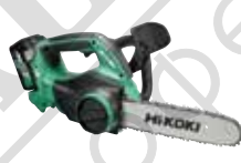
Cordless Chain Saw CS 3630DA