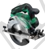
Cordless Circular Saws C 3606DA C 3607DA