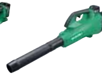
Cordless Blower RB 36DA