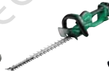
Cordless Hedge Trimmer CH 3656DA