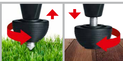
Change the combination tips