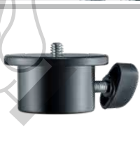
1/4" thread adapter