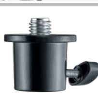
5/8" thread adapter