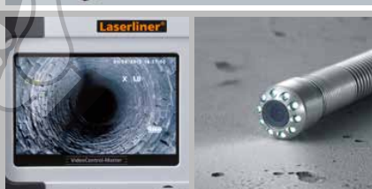
5.0" TFT colour display