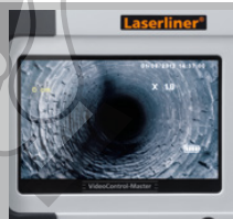
5.0" TFT colour display