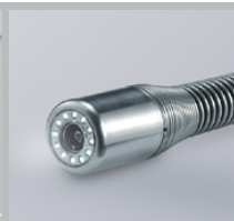
Camera head with 12 high-performance LEDs