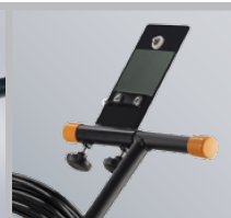
Holder for VideoControl-Master