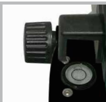
Mirror for easy alignment