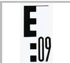
Long-distance scale with E graduation