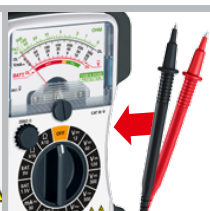
Test prod holder