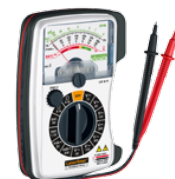
MultiMeter-Home + 2 test prods + battery

Packing dimension (W x H x D) 190 x 310 x – mm