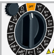
Easy-to-use rotary function knob