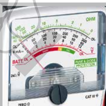
Large, easy-to-read analogue scale