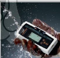
Water and dust protection per IP 67