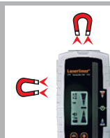
Strong head and side magnets