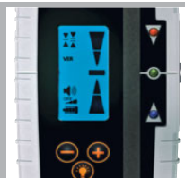
Illuminated LC display, super-bright signal LEDs