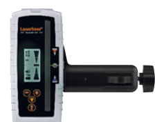
SensoLite 410 Set including universal mount + battery