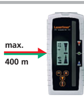
For red and green laser