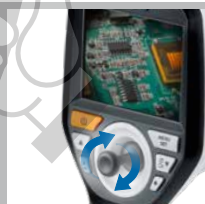
Manual 3D control