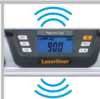
AutoSound at 0°/45°/ 90°/135°/180°