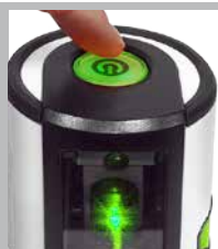
ON/OFF button and laser flash when levelling is disabled