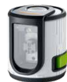
EasyCross-Laser Green + batteries

Packing dimension (W x H x D) 110 x 235 x 80 mm