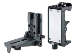
CrossGrip Pro Packing dimension (W x H x D)