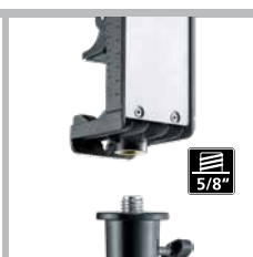
5/8" tripod threads