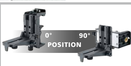
For mounting horizontally and vertically