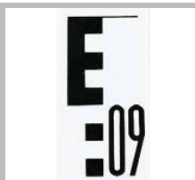
Long-distance scale with E graduation