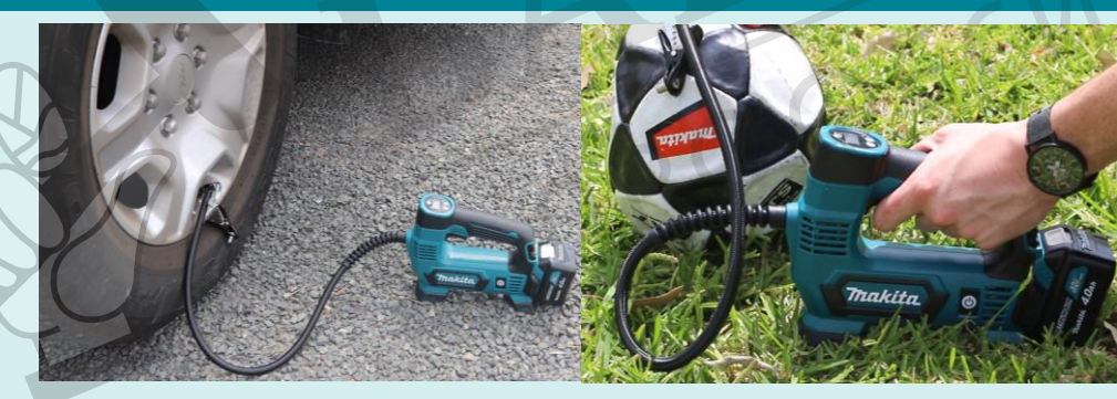
Ability to inflate car tyres, pool floats and sporting equipment