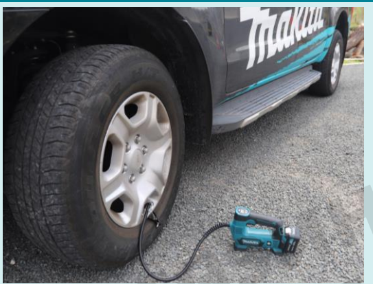
Max air pressure of 0.83MPa