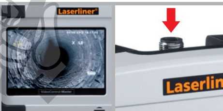
5.0" TFT colour display