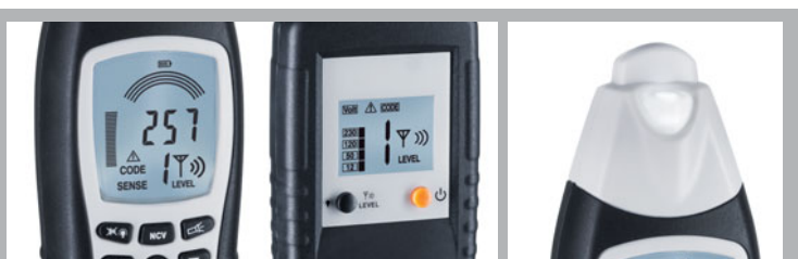
Clearly arranged, illuminated LC display