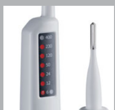
High contrast LED indicator