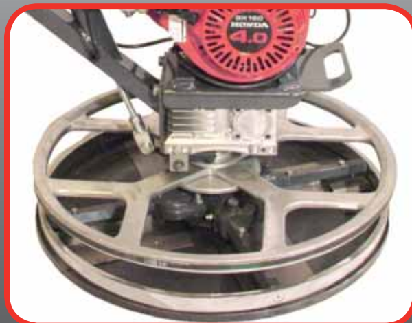
Spinning Guard Ring allows edge to edge Trowelling