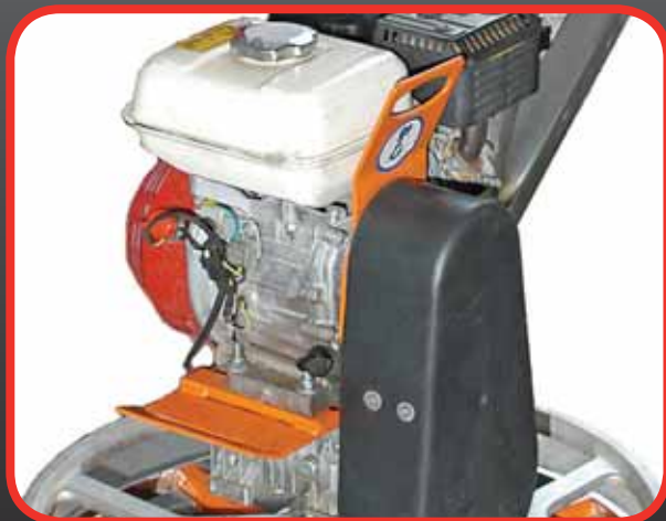
Two Lifting Points