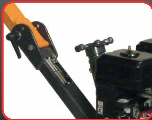
'Screw Pitch' for easy Blade adjustment