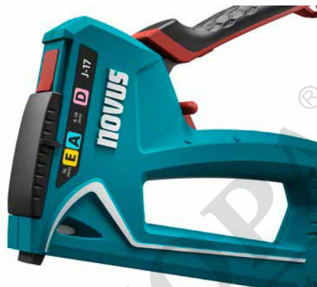
The tacker can be easily adjusted for working with nails, fine and/or flat wire staples using the slide mechanism on the front of the device.