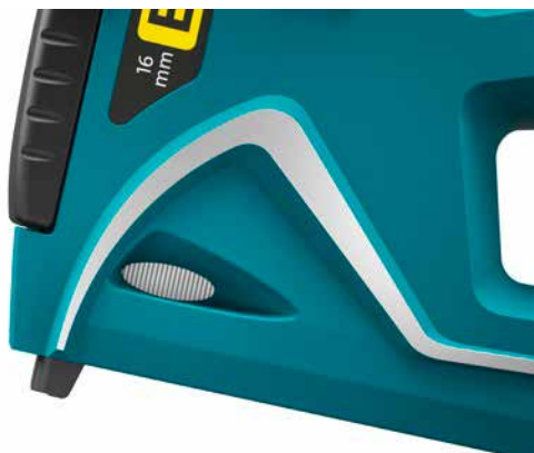
Easily visible staple level indicator