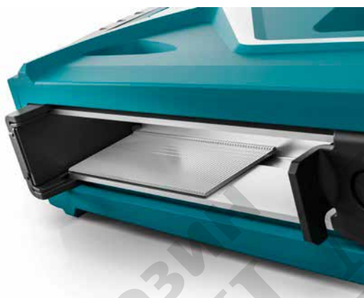
Nails are inserted on the underside of the tacker.