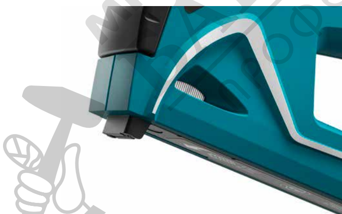
The tacker's narrow and long nozzle also permits precision stapling at poorly accessible places.