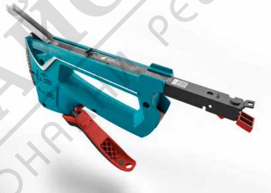
Integrated staple slider for quick loading of staples. All parts form a single unit with no loose parts to lose.